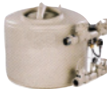
Sand and Gravel Filters