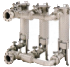
Full Flow Bag Filters