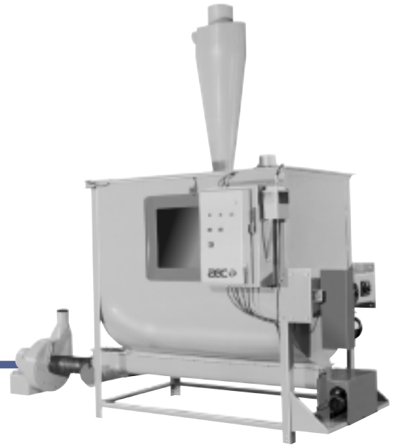
Model FT 50 (shown with optional cyclone)

AEC agitated fluff storage tanks are designed with heavy-duty agitators to handle the hardest to feed materials. Sizes range from 50 to 200 cu. ft. capacity.